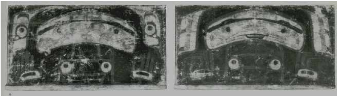
Painted chest attributed to this artist, now in the art museum at UCLA.

Of these, I would attribute the Glenbow and the RBCM chests to the earliest period in this artist's series of innovative works, and the UCLA chest to the latest period of work, one that perhaps closely followed the creation of the Koksilah chest. The subject example would best fit in the middle of these two periods, as it shows somewhat equal ties to both the earlier and the later attributed examples. (The artist may well have spent the very earliest part of his career painting wholly conventional chest designs, only moving into these more innovative styles after a time of apprenticeship.)