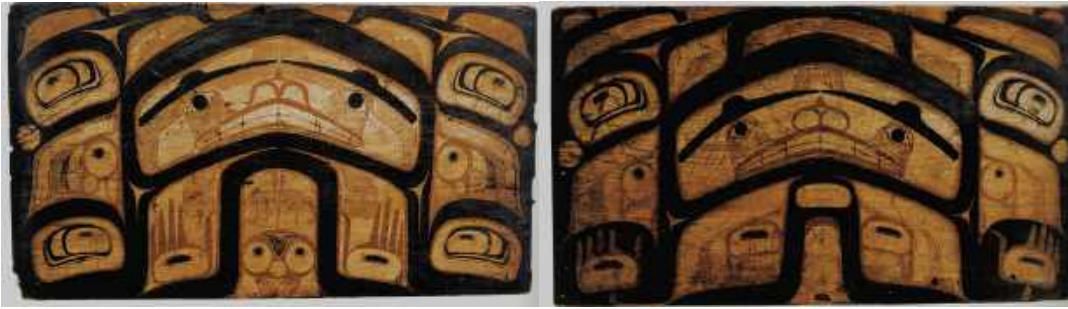
Two chest panels illustrated in Native Visions , from a private collection.

An additional example of this artist's work is recorded on the Burke Museum photo videodisk, from an unknown private collection, frame #23185. A closely related work, though probably by a different artist, is in the American Museum of Natural History [16/4969] also on the videodisk.