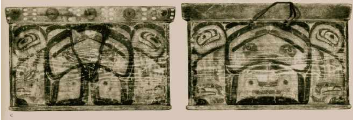
Painted chest now in the Royal British Columbia Museum, Victoria.