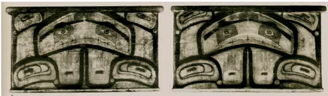
Two sides of a painted chest, now in the Glenbow Museum in Calgary, Alberta.